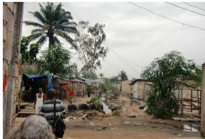
Urban sprawl in Kinshasa, now 13+ million people covering an area the size of LA – without the freeways!